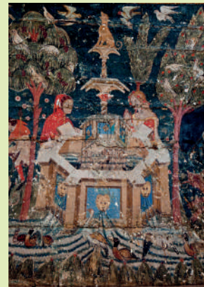
Decorative wooden panel from the northwest of the Court of the Water-Channel, in the Generalife. 13th century. Museo de la Alhambra.