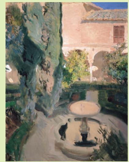
Joaquín Sorolla, [Lindaraja Garden]. 1909. Oil on canvas. Museo de la Alhambra.