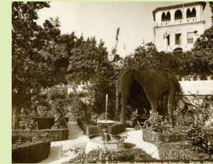
"Paths and Gardens in the Generalife" [Arbour in the High Gardens of the Generalife]. Ca. 1890.