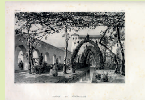
Joseph-Philibert Girault de Prangey, "Jardin du Généralife" [Court of the Water-Channel]. 1833.

It was carefully tended by the Nasrid Sultans that created it, by the governors of the Granada-Venegas family who took care of it for four centuries, and later by the managers from the Board of Trustees of the Alhambra and Generalife.