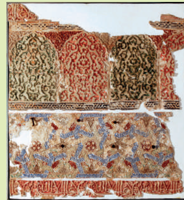
Panel of painted stucco. Western viewpoint of the Court of the Water-Channel in the Generalife, ca. 1273-1309. Museo de la Alhambra.