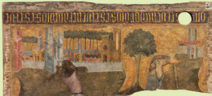
Painting on board depicting a fight between two knights. Alhambra, Palace of the Lions, Hall of the Muqarnas, ca. 1380. Museo de la Alhambra.

For garden-lovers, the Alhambra and Generalife are a sublime example of beauty and of masterful use of water.