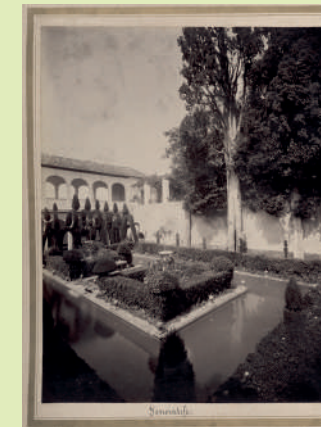
"Generalife" [Garden of the Court of the Sultana]. 1880-1890.