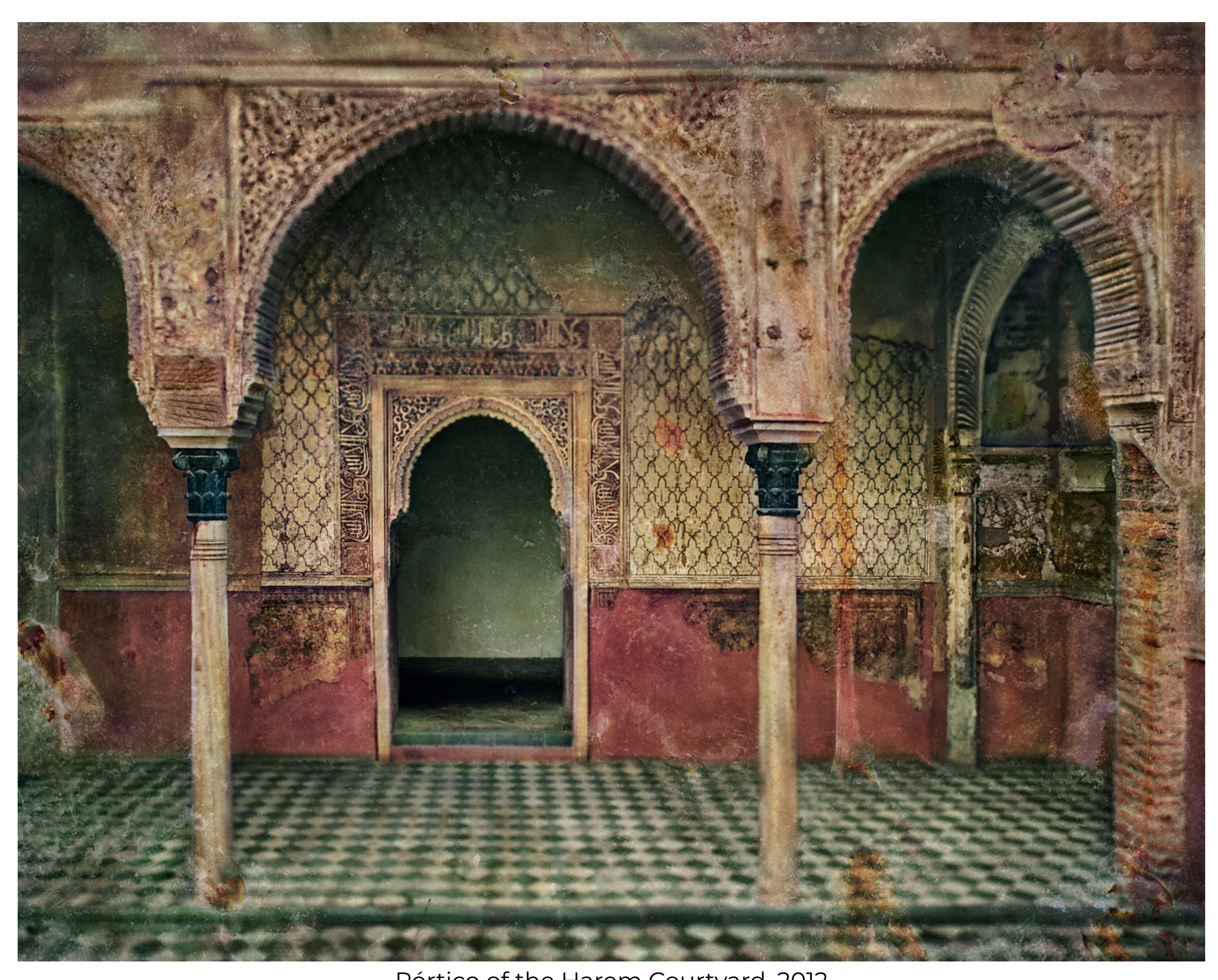
Pórtico of the Harem Courtyard, 2012