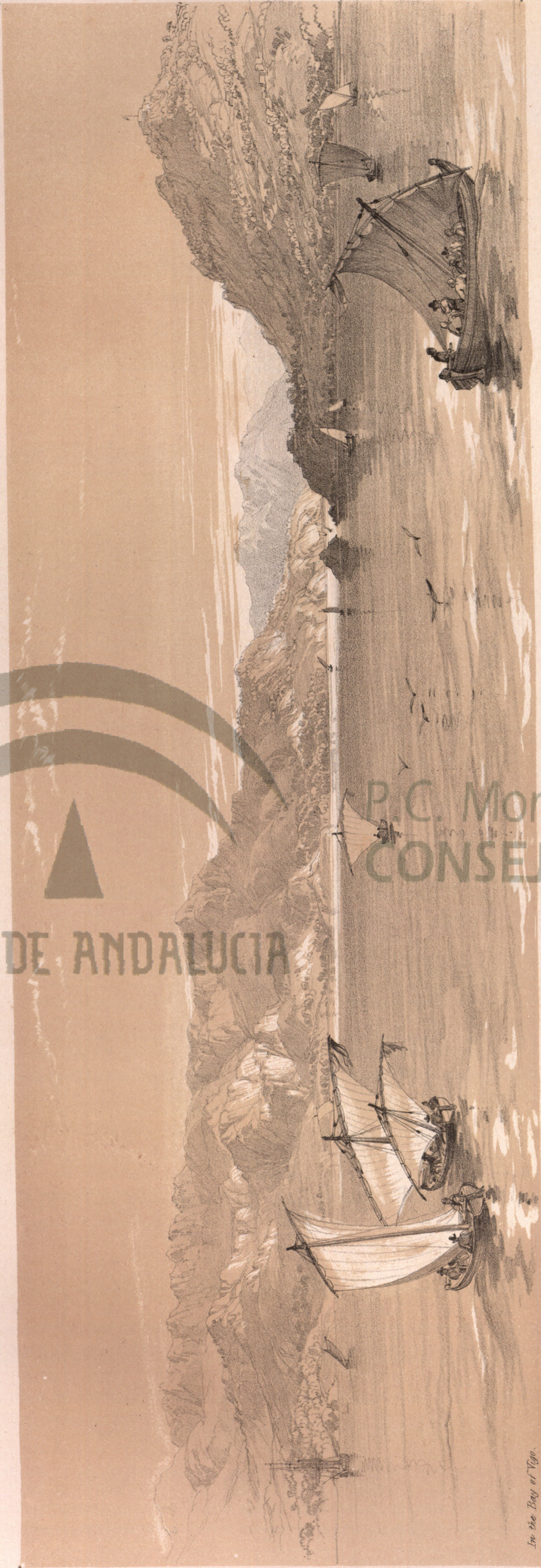
In the Bay of Vigo.