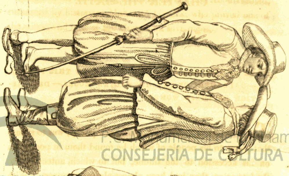
Female Drgs at Dragoe